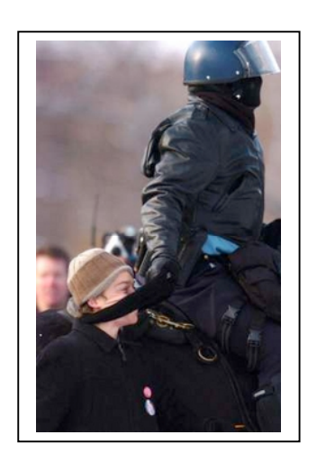
Toledo Cops tazer protesters, make preemptive arrests, and nab activists during the demo while the "Peace Team" lies down in front of horses.

On December 10, 2005 the Nazis and White Power freaks from the National Socialist Movement (NSM) invaded Toledo, OH for the second time in three months.