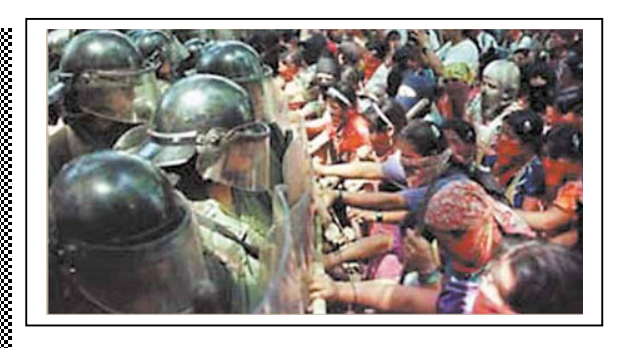
14 -18 December 2005: WTO Ministerial Conference Hong Kong

Day One Report Edited from UK Indymedia Post By Tom Grundy